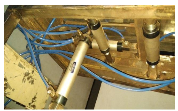
Fig. 3. Constructional details for Pneumatic system